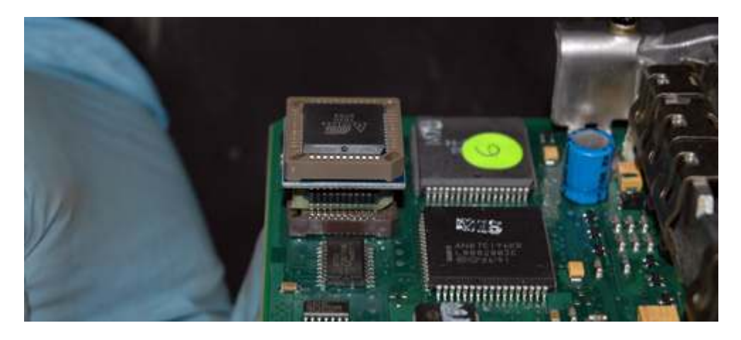
Replace ECU in reverse order of removal