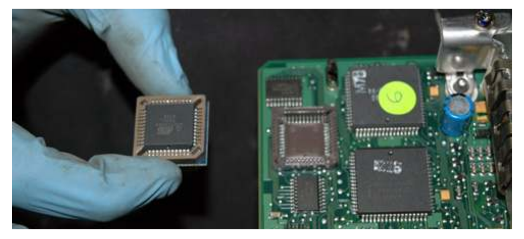
Carefully install the new chip, making sure all the pins are lined up before you push it in. The chip can ONLY go in one way. Make sure to line up the corner with the angle on it.