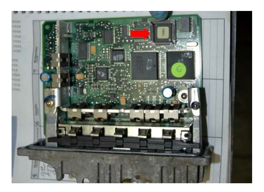
Carefully use a pick or a thumbtack to remove the old chip